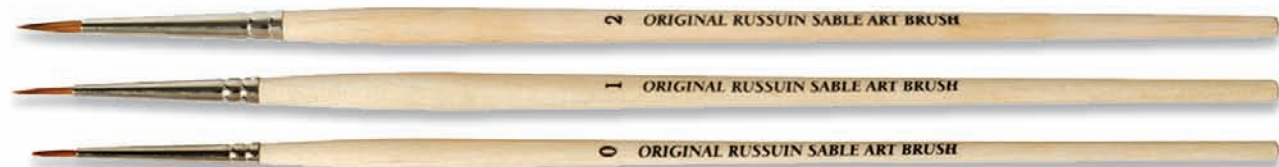
Three Kolinsky brushes set for a large field of decorating nails.