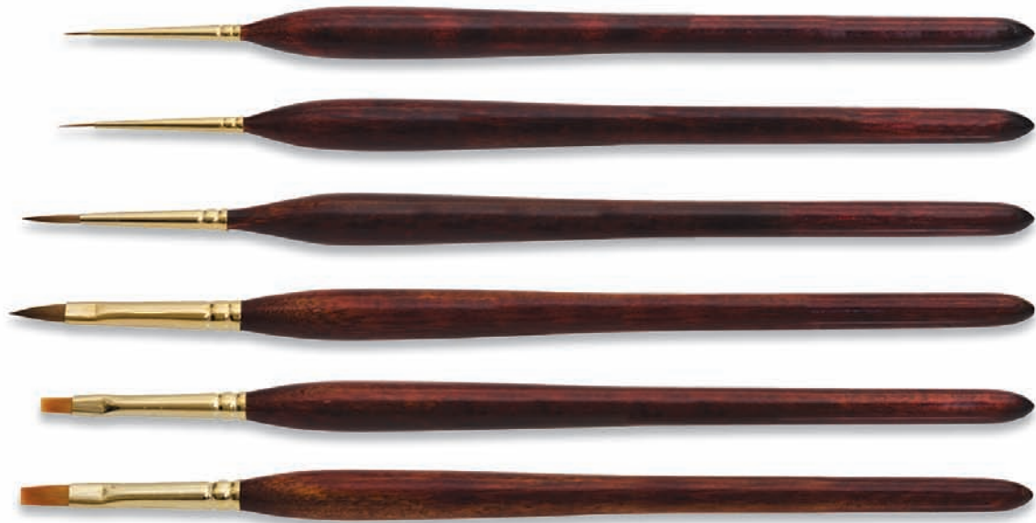
Six brushes set (Synthetic & Soft hair) for a large field of decorating nails.